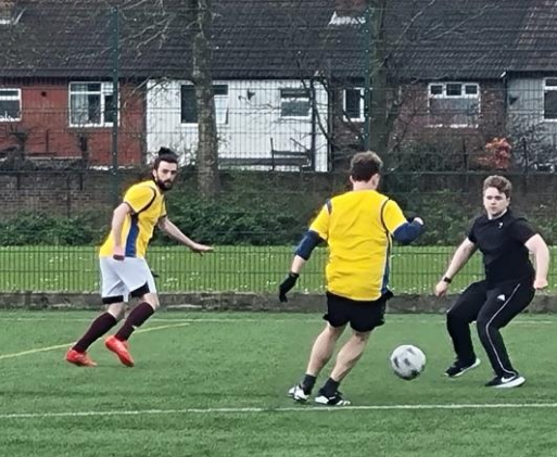
MANCHESTER 1824 Winners The University of Manchester